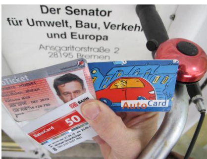
Intelligent mobility management of Bremen municipal administration: integrating bicycles, PT season ticket, rail fare reduction pass and Car-Sharing access

The City of Bremen decided to integrate its own fleet into the online booking system of the local car-sharing provider cambio. This enabled more employees to use car-sharing when the City’s own cars were fully booked and allowed the City to reduce its fleet size. Implementation was complicated, but once the specifications of data protection, car-booking procedures and location of the key-locker were finalised, integration testing ran smoothly. At the same time as introducing the new system, people were encouraged to use more sustainable transport modes like walking, cycling or the public transport system in Bremen. Implementation began in May/ June 2011.