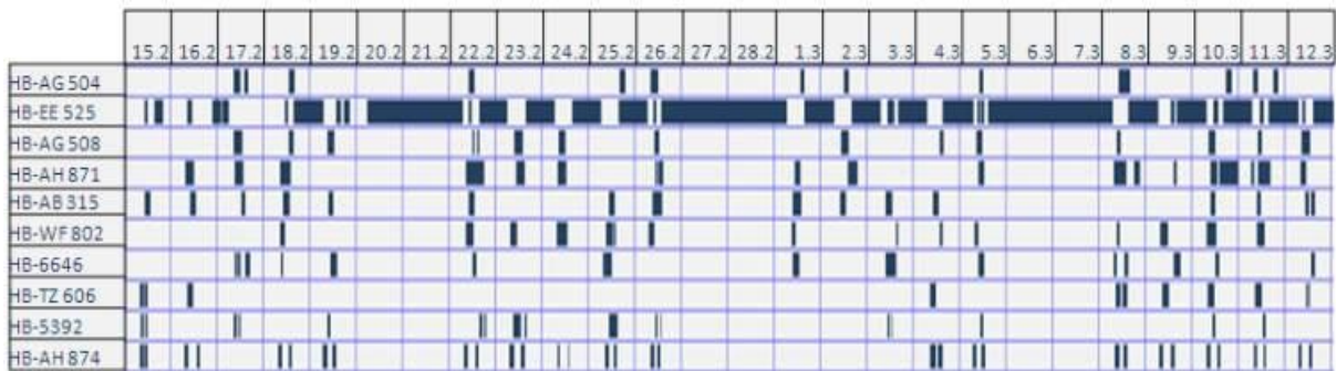
Graph 2: Degree of car utilisation of the owned and leased vehicles.

The next step of the analysis involved identifying the user profile of the fleet cars. Usage data for a four week period was taken from the vehicle logbooks and analysed using the fleet software.